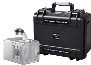
LiDAR-wiz, Scan2Cloud Series