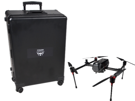
Drone-eco Plus, Fly2Map Series